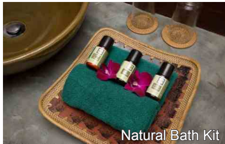
Natural Bath Kit