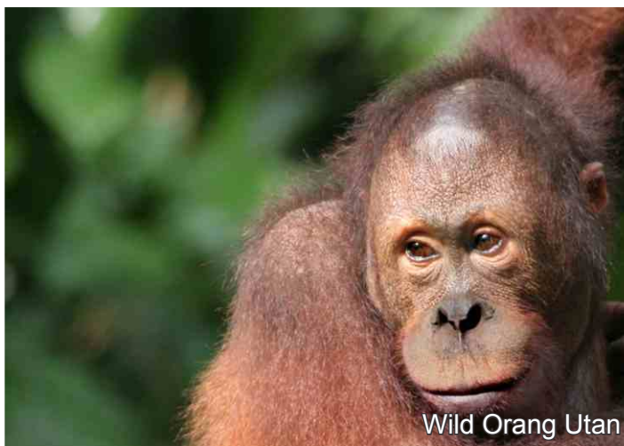
Wild Orang Utan