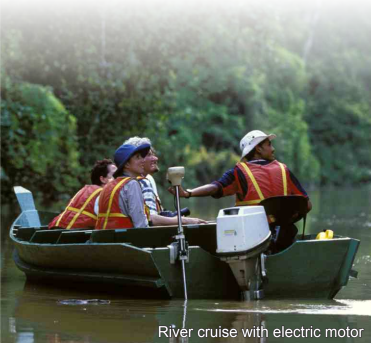
River cruise with electric motor

Sukau in the Kinabatangan Basin is a mixture of private land, forest reserve and wildlife sanctuary. Illegal logging, rapid conversion of private land into palm oil plantation and over polluting of the Kinabatangan River are some of the challenges faced in conservation effort in the areas.